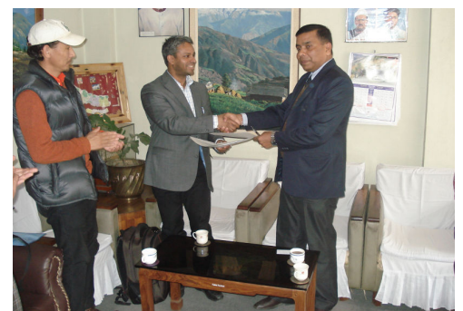
Signing General Agreement with SWC Officials