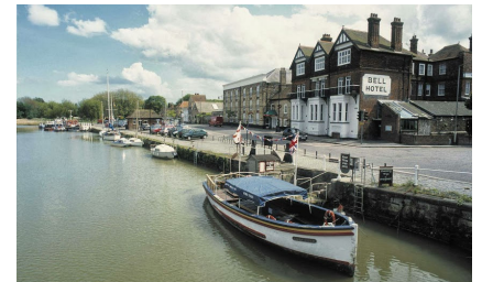
The Bell Hotel, Sandwich