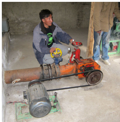
Servicing the Halji micro hydro system