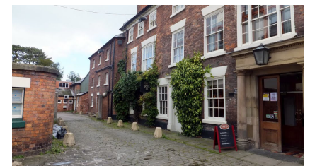
The Royal Oak Hotel, Welshpool