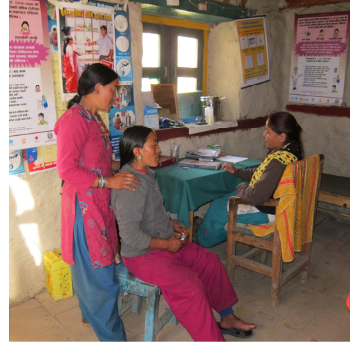
Healthcare Programme Kermi Clinic

we are making another appeal for donations specifically to support this aspect of our work. Our primary healthcare programme is funded from our general unrestricted (as opposed to project) income and runs at circa £25,000 per annum. It covers the salaries of health care workers and the procurement and distribution of medical supplies to the Nepal Trust clinics.